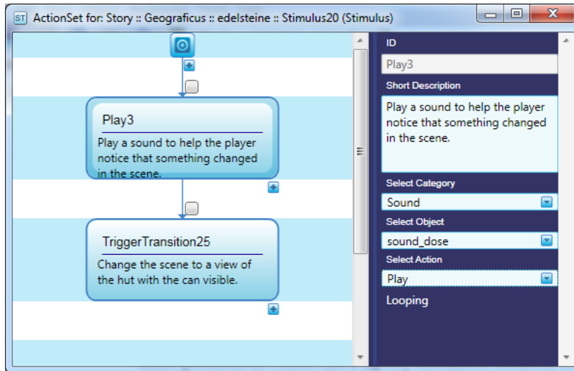
Fig. 3. The ActionSet Editor for configuration of control flow during the game

Actions as described in the previous section are configured in the ActionSet Editor (see Figure 3). Actions are aligned sequentially as well as branching based on runtime conditions. Each action has further parameters, such as the target in the case of a character movement action or the text in a dialogue action.