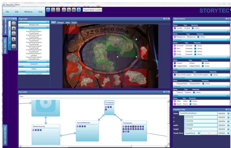
Fig. 2. StoryTec used for authoring a puzzle in an educational adventure game. The editors shown in this figure and figure 4: Stage Editor (upper left), Story Editor (lower left), Objects Browser (upper right) and Property Editor (lower right)

The modular authoring tool is composed of several interlinked editors. The first editor to be used commonly by authors is the Story Editor. This editor is used to configure the high-level structure of the game, by breaking down the whole game into a set of scene and defining the transitions between scenes. Figures 2 and 4 show two instances of the StoryTec GUI including the Story Editor.