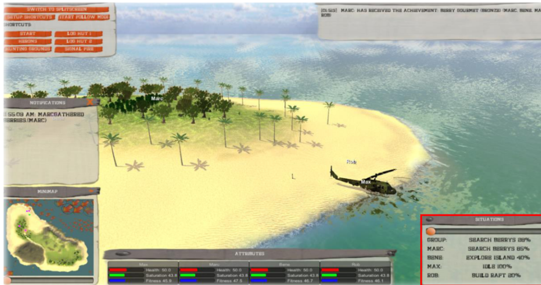
Figure 2. Game Master overview over the game including the situation recognition