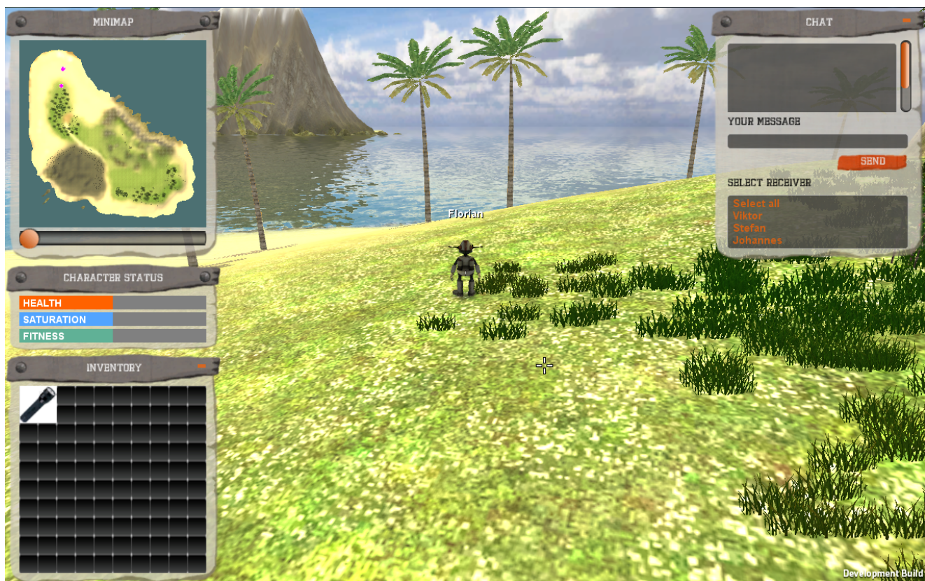
Fig. 1 Player's screen with GUI elements of Escape From Wilson Island