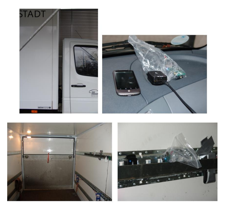
Fig. 5. Experimental setup in the conducted field test

Based on these requirements, and some additional real-life tests (a set of experiments was conducted on a truck's load area as shown in Fig. 5), we propose a connection concept employing a wireless bridge between mote and smartphone as depicted in Fig. 4.