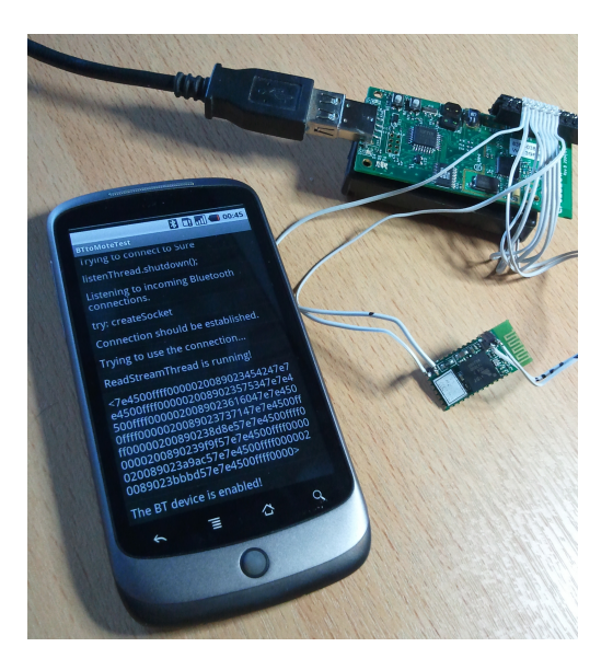
Fig. 7. Proof-of-concept implementation

Wireless sensor networks provide a promising means to enable real-time monitoring of logistics transport processes. Nevertheless, the monitored data and corresponding alert messages have to be transmitted to the responsible decision makers quickly. For this purpose, a long-range connection between wireless sensor network and end users' backend systems is needed. To provide such a connection, the usage of smartphones has been proposed as particularly promising.