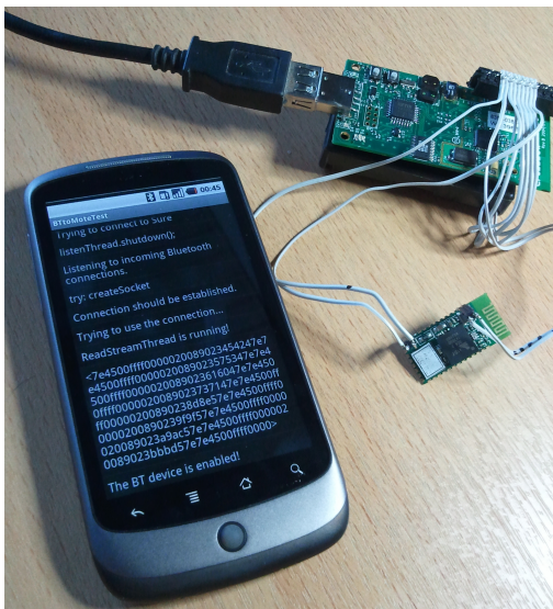
Fig. 7. Proof-of-concept implementation

Wireless sensor networks provide a promising means to enable real-time monitoring of logistics transport processes. Nevertheless, the monitored data and corresponding alert messages have to be transmitted to the responsible decision makers quickly. For this purpose, a long-range connection between wireless sensor network and end users' backend systems is needed. To provide such a connection, the usage of smartphones has been proposed as particularly promising.