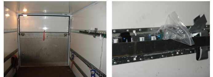
Fig. 5. Experimental setup in the conducted field test