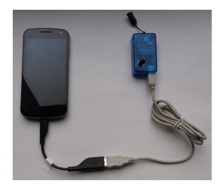
Figure 2: X-Tick-based prototype

Finally, the connection of the X-Tick module to the Google Nexus One via its USB-interface (Fig. 2) allowed us to establish an IEEE 802.15.4-based bi-directional communication channel with different mote platforms supporting IEEE 802.15.4-based communication.